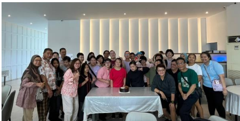
Happy bellies, happy families!