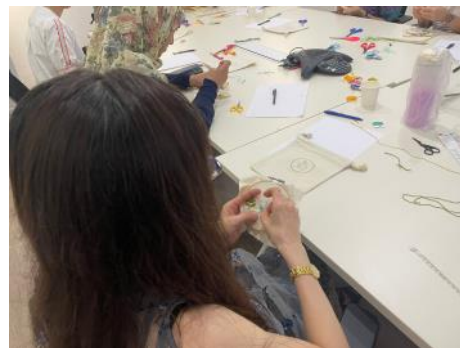
A great way to train focus and patience

Embroidery can be used as a therapeutic activity to promote mental wellness. The repetitive, rhythmic nature of stitching can induce a meditative state, helping to reduce stress and anxiety. DSA held a Flower Embroidery Workshop for caregivers on 20 April 2024. Ms. Inez Tan from Inez Designs taught participants different stitches to create several floral embroidery designs. Through this workshop, participants learnt embroidery skills and more importantly strengthened their support network and friendships with other caregivers.