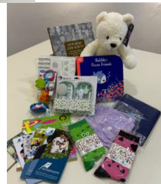
Contents* of "Welcome to Our World" basket.