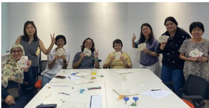
Proud of their beautiful masterpieces!