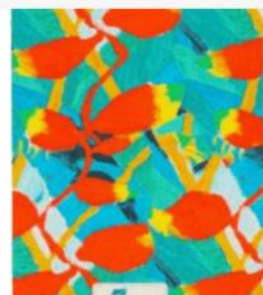
Fabric Bound Diary $15

Are you thinking of items to purchase as gifts or are you looking to purchase items in bulk? Support our DSA artists and their hand-drawn merchandise on our newly launched e-platform, CocoCart!