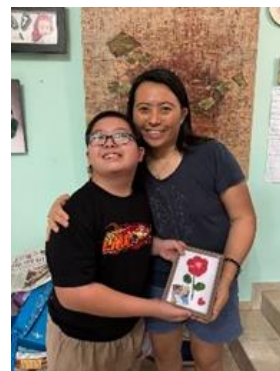
"Petals of love"