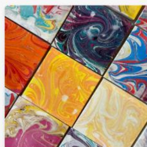
Marbled Canvas Magnet $16