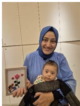
"Tiny hands, big love"