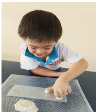
"Pressed with love"