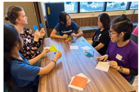
Origami with volunteers from Boon Lay Secondary School.