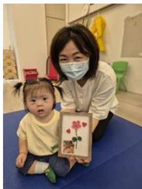
"Little fingers, lasting memories"