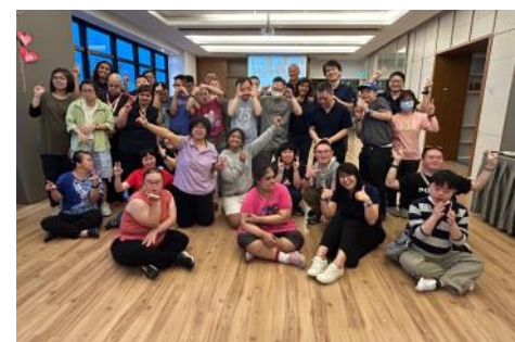
Learners had the time of their lives with Infineum volunteers