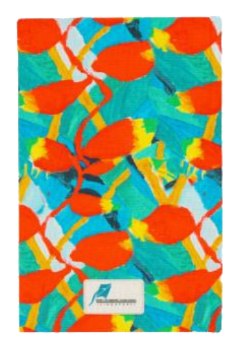
Heliconia by June Lin

22cm (L) x 14cm (W) Cotton fabric w/ inner blank pages $15