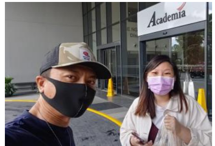
170 sets of 'Platter of Joy' from three F&B partners were delivered within four days